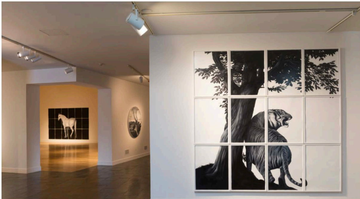
Shelley Reed, Tiger (after Janssens and Landseer), 2017, oil on paper, 90 x 88 inches; White Horse (after Grant and Stubbs), 2016, oil on paper, 90 x 132 inches; City Bound (after Ward and Breenbergh), 2014, oil on canvas, 48-inch diameter. Installation view, A Curious Nature: Paintings by Shelley Reed , Fitchburg Art Museum.

With meticulous visual description, Reed's paintings oscillate our attention between her elaborately composed allegorical scenes, such as In Dubious Battle , and her dramatically isolated subjects, as seen in White Horse (after Grant and Stubbs). The two styles of composition are diametrically dispersed throughout the galleries. Organized by curators Lisa Crossman and Mary Tinti, the intuitive layout accentuates the artist's varying narrative structures, almost as a means of psychologically zooming in and out of each painting's proposed perspective. The combination of this visual and narrative tactic makes it all-too-easy to forget the fact that most of Reed's subjects are in fact animal, not human—each containing their own palpable psychologies to be reckoned with.