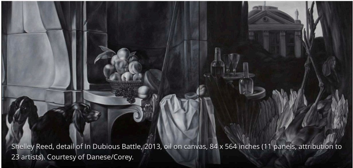
Shelley Reed, detail of In Dubious Battle , 2013, oil on canvas, 84 x 564 inches (11 panels, attribution to 23 artists).